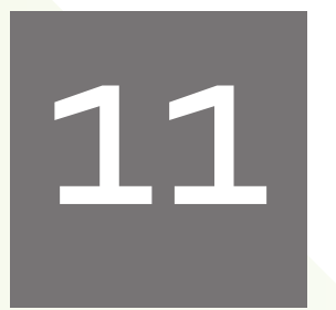
Future direction: towards collaborative networks and benchmarking