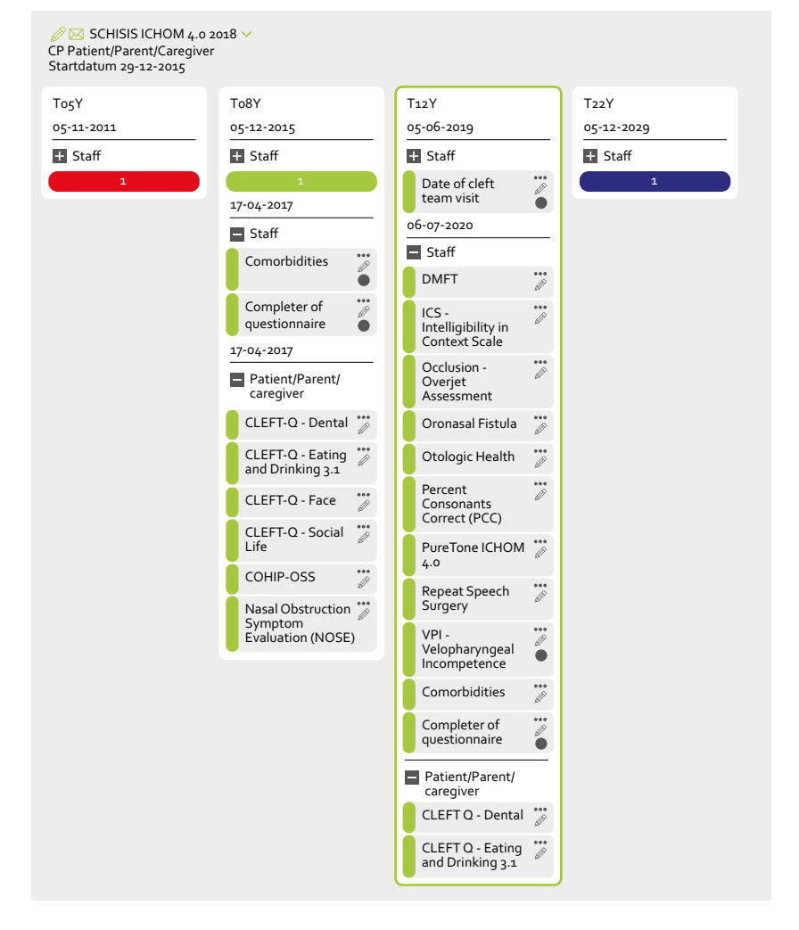
Figure 2: Erasmus University Medical Center's Data Collection Tool.

Each column represents a timepoint (o, 5, 8, 12 and 22 years) for the collection of case-mix variables and clinical outcomes (indicated by 'staff') and/or patientreported outcome measures (indicated 'parents/caregivers'). Green buttons indicate the measurement has been completed and can be viewed, whereas the yellow measurements are still open for completion. Red buttons represent time for completion has expired. Blue buttons